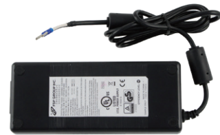
12V / 150W power adaptor (P/N: A005PS150W0314000P)